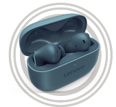
Lenovo TWS YOGA PC Edition