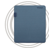
Yoga 14-inch Sleeve