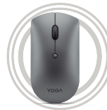
Lenovo Yoga Slim Mouse